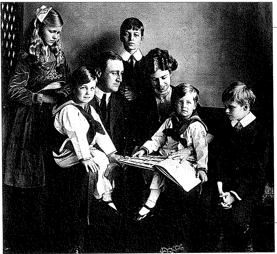
Momma's boy: Franklin Roosevelt, here with Eleanor, was, like many politicians, a golden child